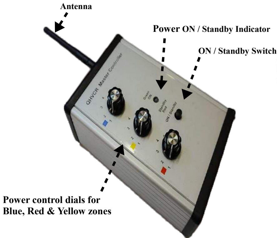
Power control dials for Blue, Red & Yellow zones